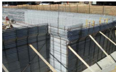
Blind Side Wall